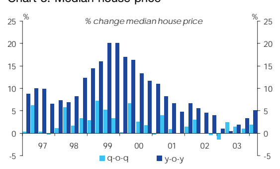
Chart 3: Median house price