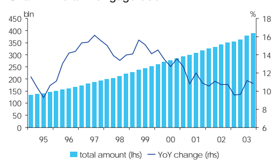
Chart 1: Total mortgage debt